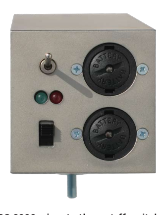
RSG 3000, view to the on/off switch, battery slots, comb spacing switch and LEDs