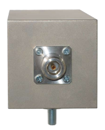
RSG 3000, view to the N connector