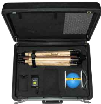
KSQ 1001 in suitcase