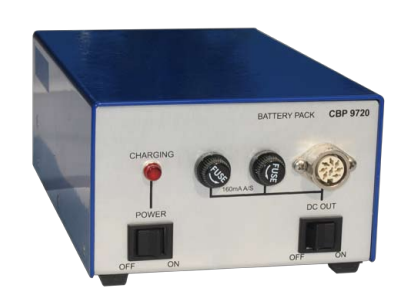
CBP 9720 (battery pack and power supply)