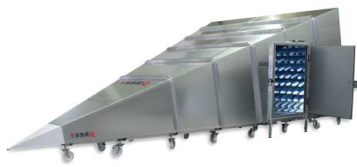
GTEM 1750, door right side, option EUT MG, option wheels

A GTEM (Gigahertz Transverse Electro Magnetic) cell is a test site for efficiently performing both radiated immunity and emissions testing in a single, controllable and shielded environment. Compared to other test sites, GTEM testing is faster with high accuracy and excellent reproducibility.