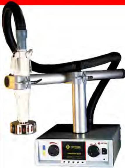
ATS-505 SHOWN WITH OPTIONAL THERMAL STAND

Advanced Temperature Source for fast and precise thermal conditioning of components, parts, hybrids, modules, subassemblies, and printed circuit boards. Capable of low temperatures without the use of Liquid Nitrogen (LN 2 ) or Liquid Carbon Dioxide (LCO 2 ).