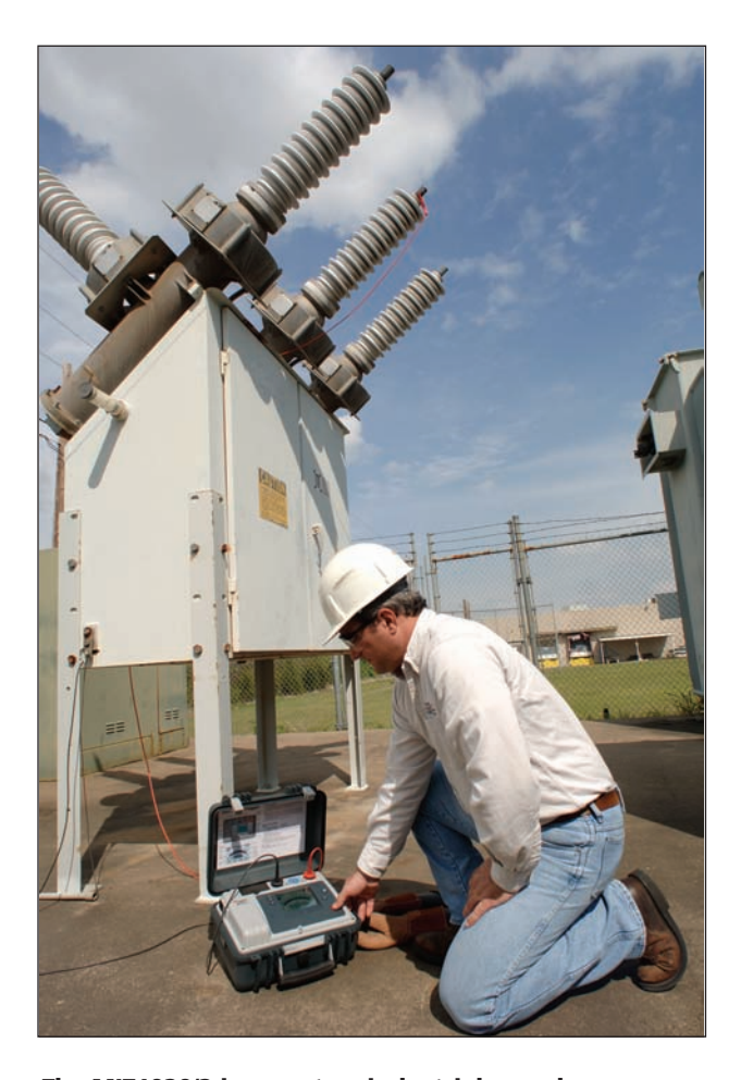
The MIT1020/2 in use at an industrial complex substation

With its higher voltage testing capability, the MIT1020/2 is the perfect every day work tool for manufacturers, users and maintainers of rotating machinery. Designed in accordance with the requirements of IEEE43:2000 the MIT1020/2 is ideal for measuring the insulation resistance of armature and field windings in rotating machines rated 1hp (750 W) or greater. The standard applies to synchronous, induction and dc machines as well as synchronous condensers.