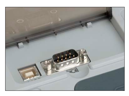
Extra data storage and download capability Run more tests and save more test data.

Download results using either an RS232 or USB style connection (MIT520/2 and MIT1020/2 only).