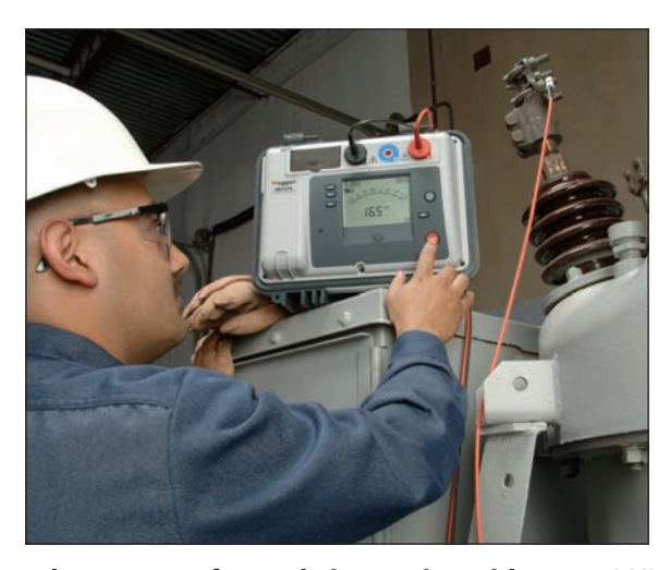
Delta wye transformer being testing with a MIT520/2