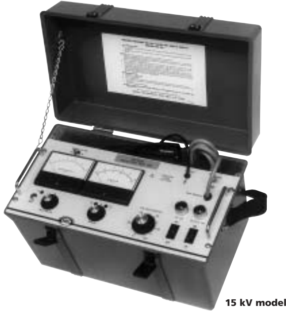
15 kV model