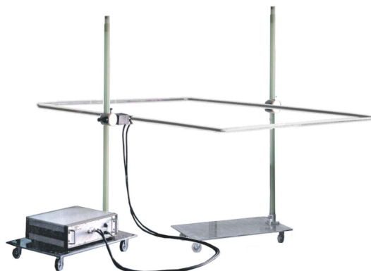
MAG 100 current transformer, 2m x 2.6m antenna mounted on two support stands

To be used for EMC Tests requiring AC Magnetic Fields