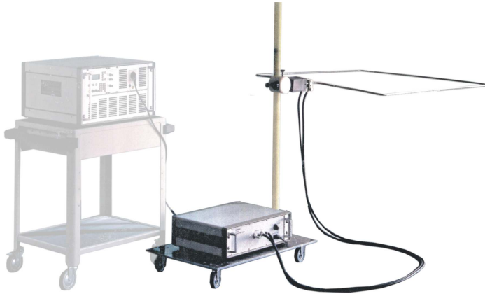
MAG 100 current transformer, 1m x 1m antenna mounted on support stand (right) shown with the power source (left)