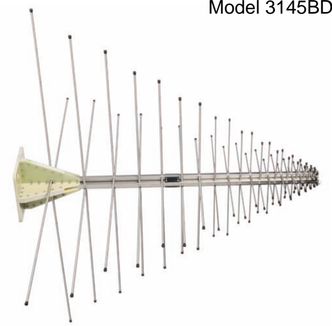
ETS-Lindgren's Model 3145BDP Dual-Polarized Array