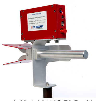
ETS-Lindgren's Model 3116C-PA Double-Ridged Waveguide Horn Antenna with Pre-Amplifier