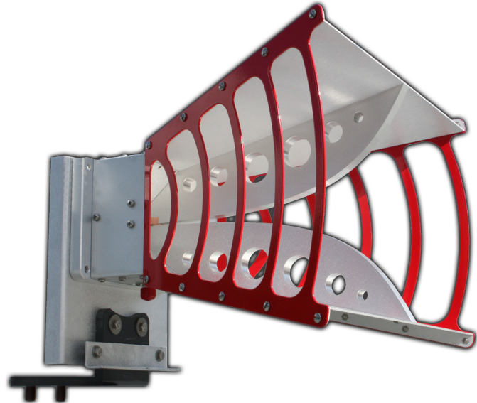
ETS-Lindgren's Model 3119 Double-Ridged Waveguide Horn Shown with Standard Tripod Mounting Bracket

The Model 3119 Double Ridged Waveguide is the latest addition to a family of double ridge waveguides for wireless and EMC measurement from ETS-Lindgren. Users of this antenna benefit from uniform illumination of target surfaces and accurate gain measurement. In addition, the Model 3119 exhibits high gain and low VSWR across its operational frequency band, accepting power input of 1500 watts.