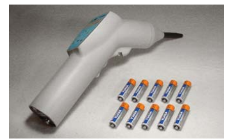
ESD3000 is powered by regular or rechargeable batteries.