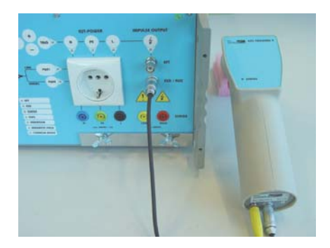
TRA3000 with EXT-TRA3000 E