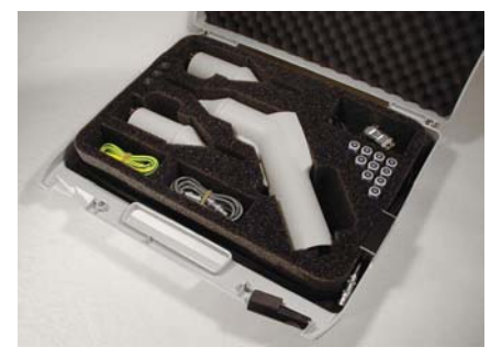
ESD3000 – EMC PARTNER's battery operated, portable, 30 kV ESD generator