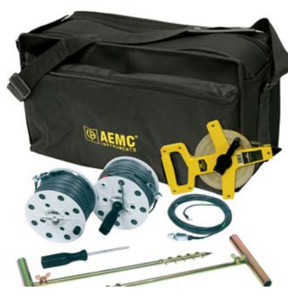
Test Kit – 3-Point includes carrying bag, two 150 ft color-coded leads on spools, two 16" auxiliary ground electrodes, one 16 ft lead with Mueller® clip and one 100 ft tape measure Catalog #2130.62

The Models 4620 and 4630 are built into a double case. This extra rugged construction provides double insulation, maximum field durability and ease of serviceability.