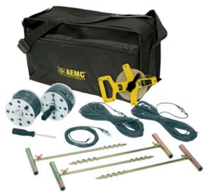
Test Kit – 4-Point includes carrying bag, two 300 ft colorcoded leads on spools, two 100 ft color-coded leads, four 16" auxiliary ground electrodes, one 16 ft lead with Mueller® clip and one 100 ft tape measure Catalog #2130.63