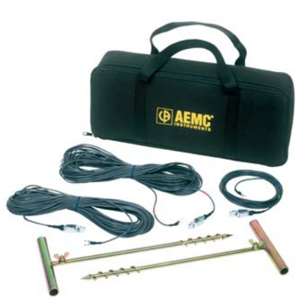
Ground Test Kit – 3-Point (supplemental 4-Point) includes carrying bag, two 100 ft color-coded leads, one 16 ft lead and two 16" auxiliary ground electrodes Catalog #2130.61